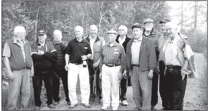
The 57 Grads at Memorial Tree Planting